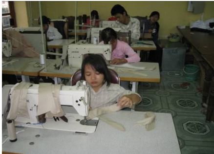
A vocational training

Please note that SJ Vietnam keep the possibility to change the workcamp's program – only concerning certain tasks - in order to suite it to the needs of the welfare center.