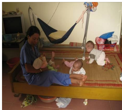
While taking care of the orphans