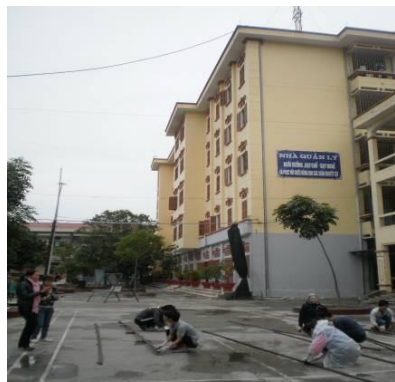
The volunteers are building a stage

In the welfare center, the children are handicapped in many different ways. Some are deaf mute , some are mentally disabled , some are physically disabled , and some are both. Some of them can make many activities and some of them are heavily handicapped. So all the activities you plan have to be adapted to the children. They all have different skills and difficulties. Try to be imaginative and flexible. With one more or one less rule in a game you can make it more accessible to all of them. The children can have unexpected behaviours. Be ready to deal with it. There will be a Vietnamese teacher to help you in the activities.